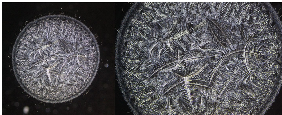
Fig. 1 Image capture of entire tear microdesiccates by using low power objective lens. Digital image of an entire microdesiccate (about 3 mm diameter) produced from a 1 \mu\text{L} -aliquot of tear was captured by using a microscope fitted with 10 \times eyepieces and a 2.5 \times objective lens (left). Image capture was only partial when the objective lens was replaced by a conventional 5 \times objective lens (right)

Every single tear microdesiccate was observed through an orderly sequence of transmitted-light brightfield (BF),