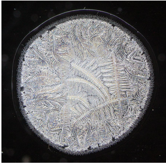
Fig. 5 Representative image of a normal tear microdesiccate as observed by transmitted-light microscopy with phase 2 illumination. Both tear microdesiccate production and the lens system of the microscope were those described in the legend to Fig. 3. Both the outer border of zone I and its close contact with a well-defined transition band are two main features of tear microdesiccates derived from Ph2 illumination. Fern-like crystalloids of zones II and III are also seen