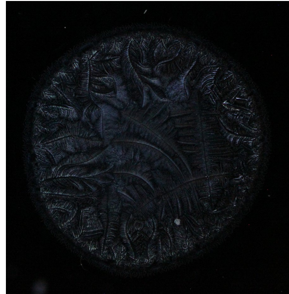
Fig. 7 Representative image of a normal tear microdesiccate as observed by transmitted-light microscopy with dark-field illumination. Both tear microdesiccate production and the lens system of the microscope were those described in the legend to Fig. 3. Zone I is not visible, the transition band becomes somewhat diffuse and fern-like crystalloids become the main visible structures as a consequence of light-scattering