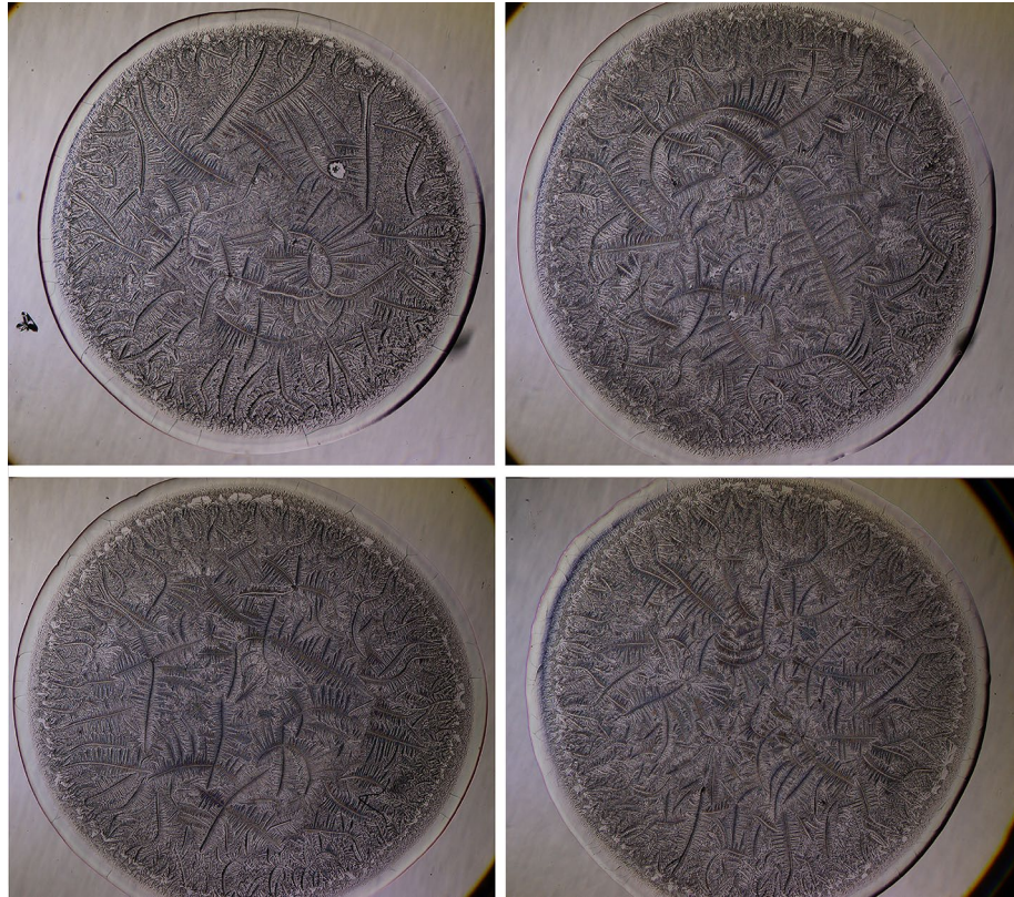
Fig. 11 Reproducibility of tear microdesiccates produced from single healthy subjects and imaged with Ph1 + /Ph2 microscopy. Microdesiccates produced from quadruplicate 1- \mu L aliquots of a single sample of tear taken from a healthy subject and observed by transmitted-light microscopy with Ph1 + /Ph2 illumination displayed marked similarities concerning features of the four main morphological domains. Digital images of microdesiccates were captured at 25 \times magnification (10 \times eyepiece and 2.5 \times objective lens)

on glass surfaces and their analysis by light microscopy is widely known as the tear ferning test. Certainly, such nomenclature draws attention to a single goal [10, 17, 18]. On the other hand, most of reports on tear microdesiccates do coincide in documenting just a very minor area of every single microdesiccate [2, 7, 8, 20, 21]. Considering both variety and abundance of structures and domains that are usually present in normal tear microdesiccates, such selection is by far a confounding factor. Another also important factor accounting for the only partial use of the information derived from any tear microdesiccate is the lack of standardization among the observation procedures used in different studies. Thus, observations reported to have been made at magnifications of either 10 \times [21–23], 40 \times [8], 25 and 125 \times [17], 40–100 \times [24], 100 \times [25], or even 400 \times [9], are hardly comparable. Moreover, reports rarely indicate the particular combination of ocular and objective lenses used in the observations, which can also preclude comparisons and be of great significance for appropriate data collection. Quite often, the areas of the fields of view