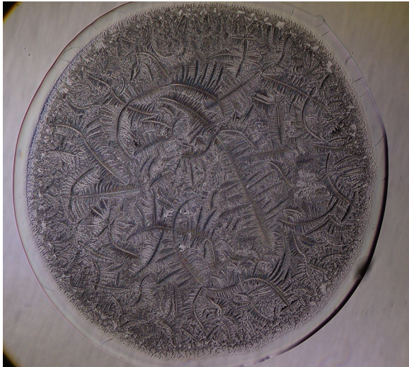
Fig. 9 Representative image of a normal tear microdesiccate as observed by transmitted-light microscopy with Ph1 + /Ph2 illumination. Both tear microdesiccate production and the lens system of the microscope were those described in the legend to Fig. 3. Again, both a roughly cylindrical continuous zone I, a complex transition band and the structured body of the tear desiccate displaying clearly defined major and minor crystalloids could be jointly appreciated. Filaments can be also seen as integral parts of zone I