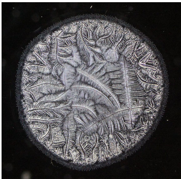
Fig. 6 Representative image of a normal tear microdesiccate as observed by transmitted-light microscopy with phase 3 illumination. Both tear microdesiccate production and the lens system of the microscope were those described in the legend to Fig. 3. Zone I is not visible but the transition band is well-defined. In addition, optimum contrast of fern-like crystalloids is achieved so that the border between zones II and III can readily be identified

from different subjects. The internal border of zone I was now shown to be in contact with a distinctive structured transition band. Using Ph1, the transition band could be seen as composed of highly interwoven filamentous elements (invisible with the brightfield microscopy!) delimiting the whole mass of tear crystalloids. Ph1 microscopy also showed that fern-like and leaf-like centripetally oriented structures emerge from the transition band and seem to be anchored to it. Though individually those structures were not well-defined, as a group they configured a better defined zone II of tear microdesiccates. Likewise, the centermost part of the desiccate (zone III) could be identified by default after the identification of the inner limits of zone II but own structures of zone III could be seen without much structural details. When the stop position of the condenser was changed to Ph2, zone I became barely visible although some filamentous structures crossing it (whose number was dependent upon the particular tear sample) were easily seen (Fig. 5). By this observation method a well-defined transition band consisting of highly convoluted filamentous components with nitid limits both toward zone I and zone II could be appreciated. Toward the center of the microdesiccate, crystalloids of zones II and III became better resolved. Using the stop position Ph3 of the condenser, zone I fully