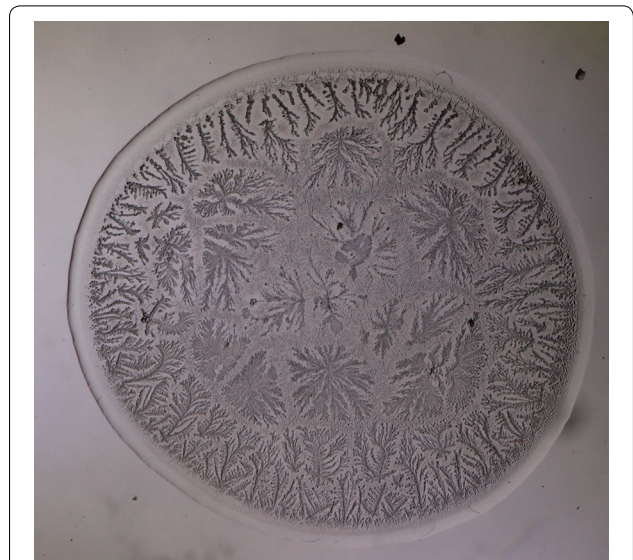
Fig. 8 Representative image of a normal tear microdesiccate as observed by transmitted-light microscopy and BF/Ph1 illumination. Both tear microdesiccate production and the lens system of the microscope were those described in the legend to Fig. 3. Both a roughly cylindrical continuous zone I, a complex transition band and the structured body of the tear desiccate displaying a variety of major and minor crystalloids could be jointly appreciated. Some filaments can be seen as integral parts of zone I

Apart from data collection from tear microdesiccates using the standard fixed positions of a universal 5-position condenser system turret, additional observations were conducted by setting the condenser in intermediate positions between some of the standard ones. This study aimed at getting single images of tear desiccates showing optimally their four main morphological domains. Because post-Ph2 positions in the turret disk, including Ph3 and DF, had resulted in a marked invisibilization of zone I, the new observations were focused on positions between BF and Ph1 as well as between Ph1 and Ph2. Turret positions between BF and Ph1 (Fig. 8)