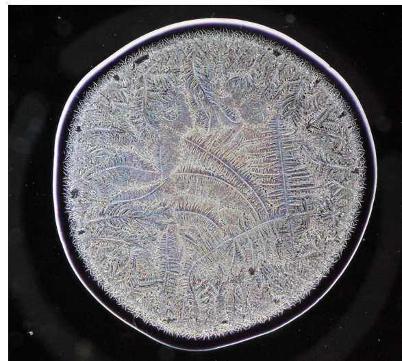
Fig. 4 Representative image of a normal tear microdesiccate as observed by transmitted-light microscopy with phase 1 illumination. Both tear microdesiccate production and the lens system of the microscope were those described in the legend to Fig. 3. The bright halo of light on the border of the microdesiccate defines a thick morphological zone I surrounding a complex mass of tear crystalloids

phase contrast (Ph1, Ph2, Ph3) and darkfield (DF) microscope techniques. As shown in Figs. 3, 4, 5, 6 and 7, each of those techniques provided different but complementary images. Transmitted-light brightfield microscopy of tear desiccates provided sufficiently contrasted images showing a regular mostly homogeneous bulky continuous structure (zone I) serving as an external boundary for the whole microdesiccate (Fig. 3). Such feature was better defined by lowering of light intensity. Toward the inside of the desiccate and close to zone I, poorly defined bunches of relatively small fern-like structures could be seen. These would represent zone II. A few major fern-like crystalloid structures in zone III at the center of the microdesiccate were hardly seen. The transition band was not seen at all. Transmitted-light phase contrast technique for observing tear microdesiccates was conducted using successively the phase stop positions Ph1, Ph2 and Ph3 of a universal 5-position condenser system turret. Using the stop position Ph1, a translucent perimetral band (zone I) was a remarkable feature of microdesiccates (Fig. 4). With this observation method, the external border of zone I represented a well-defined limit of the whole microdesiccate. Individual or interconnected filamentous structures crossing the whole width of zone I were visible. This was a highly variable feature among microdesiccates