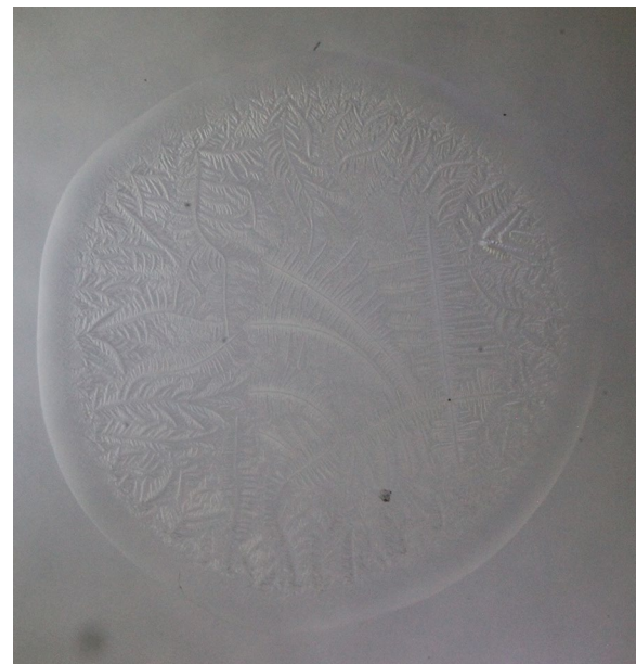
Fig. 3 Representative image of a normal tear microdesiccate as observed by transmitted-light microscopy with bright-field illumination. A tear microdesiccate was produced from 1 \mu L of a tear sample and then observed with a microscope fitted with a 10 \times eyepiece and a 2.5 \times objective lens and a universal 5-position condenser system turret. Zone I is seen as a homogeneous bulky continuous structure that surrounds a mass of highly diverse poorly defined crystalloids

phase contrast (Ph1, Ph2, Ph3) and darkfield (DF) microscope techniques. As shown in Figs. 3, 4, 5, 6 and 7, each of those techniques provided different but complementary images. Transmitted-light brightfield microscopy of tear desiccates provided sufficiently contrasted images showing a regular mostly homogeneous bulky continuous structure (zone I) serving as an external boundary for the whole microdesiccate (Fig. 3). Such feature was better defined by lowering of light intensity. Toward the inside of the desiccate and close to zone I, poorly defined bunches of relatively small fern-like structures could be seen. These would represent zone II. A few major fern-like crystalloid structures in zone III at the center of the microdesiccate were hardly seen. The transition band was not seen at all. Transmitted-light phase contrast technique for observing tear microdesiccates was conducted using successively the phase stop positions Ph1, Ph2 and Ph3 of a universal 5-position condenser system turret. Using the stop position Ph1, a translucent perimetral band (zone I) was a remarkable feature of microdesiccates (Fig. 4). With this observation method, the external border of zone I represented a well-defined limit of the whole microdesiccate. Individual or interconnected filamentous structures crossing the whole width of zone I were visible. This was a highly variable feature among microdesiccates